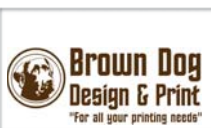
BROWN DOG DESIGN & PRINT