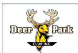
DEER PARK CLUB