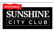
SUNSHINE CITY CLUB