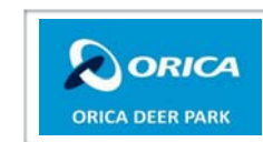
ORICA DEER PARK