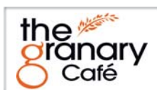
THE GRANARY CAFE