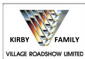
VILLAGE ROADSHOW LTD

A huge thank you to all of our wonderful & loyal sponsors for their kind support.