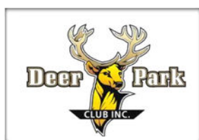
DEER PARK CLUB