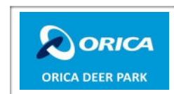
ORICA DEER PARK