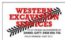
WESTERN EXCAVATION SERVICES