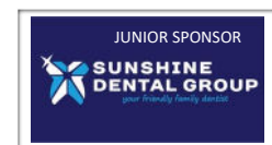
SUNSHINE DENTAL GROUP