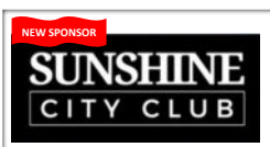
SUNSHINE CITY CLUB