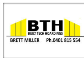
BUILT TECH HOARDINGS