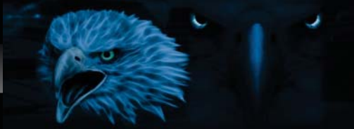
Masters White team