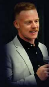
NEXT BIG STAR? Time to let the hair down :-)